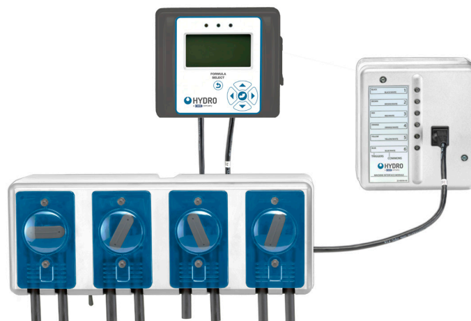
Shown with Total Eclipse Controller and Machine Interface

The standard LM-200 pumps have a reference output of 12 oz./min.